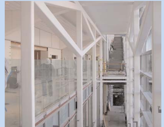
Bronx Criminal Courthouse

contractor to execute a major portion of the interiors and site finish work for this new $324.7 million Courthouse, located on East 161st Street near Grand Concourse Boulevard in the Bronx. When completed, the complex will encompass 2.5 city blocks, and the project will create a building of approximately 940,000 gross square feet of court and court-related space.