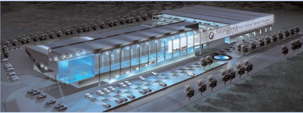
BMW Showroom and Service Center

office building in Westbury, New York for one of the premier automotive dealerships in the United States. It was also engaged to assist with full pre-construction services, which included budgeting, scheduling, constructability reviews, value engineering and document coordination reviews. This multi-phase project consisted of four major components: 1) a 42,000 square feet 52-bay, state-of-the-art automobile service center; 2) a 72,000 square feet, three-story high-end