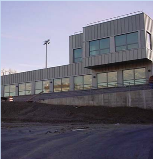
New York Structural Biology Center

Cauldwell Wingate was engaged as the construction manager for the new state-of-the-art research imaging facility for the New York Structural Biology Center, a consortium of nine major research institutions. Located on the campus of City College in upper Manhattan, the project is designed to provide a central state-of-the-art resource for the large community of structural biologists in the region and to encourage extensive collaboration in conducting complex experiments. It will also offer an array of costly instruments that, individually, the participating institutions could not afford.