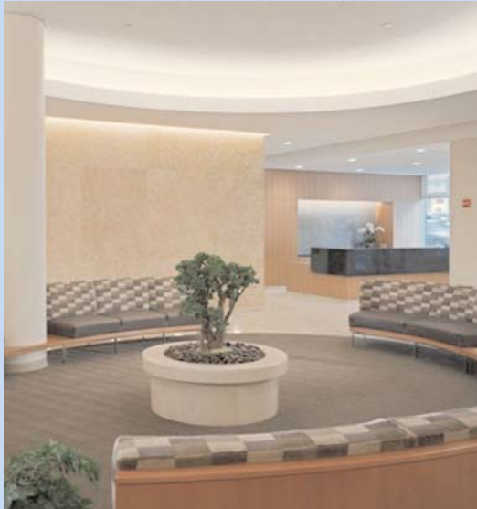
New York University Hospital Ambulatory Cancer Care Center Facility

The firm was retained by New York University Hospitals to provide construction management services for their new ambulatory cancer care facility. This project consisted of 13 floors, including two which were below grade, in a new building being constructed in midtown Manhattan. This cancer care facility houses a radiation therapy unit with linear accelerators, a simulator room, exam rooms, doctors' offices, infusion suites, pharmacy, laboratory conference areas and patient waiting areas.