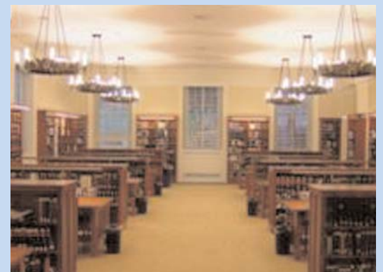
Vanderbilt Hall, New York University

New York University retained Cauldwell Wingate as the Construction Manager for major renovations to the Law School building on Washington Square South. There were four major areas of work: 1) The MEPS Program: The MEPS Program required the complete demolition and removal of most air handling units within the five-story building. New roof top units were installed and encased in copper clad enclosures to match the existing copper mansard roof. In addition to the BMS controls, new VAV boxes and riser work was completed to effect a totally new mechanical infrastructure. 2) Corridor: Corridor work included the removal of existing sheet rock ceilings and the installation of a new pocketed ceiling design with pendent lighting. Private offices were renovated, receiving all new air distribution, lighting and finishes. 3) Core Bathrooms: Core bathrooms were upgraded to ADA compliance and new finishes. 4) Library Renovation: The Library renovation included new overhead lighting and ceiling details, the installation of a passenger lift, and the creation of a new lobby with new millwork and finishes. The entire project was completed within a 10-week summer recess schedule.